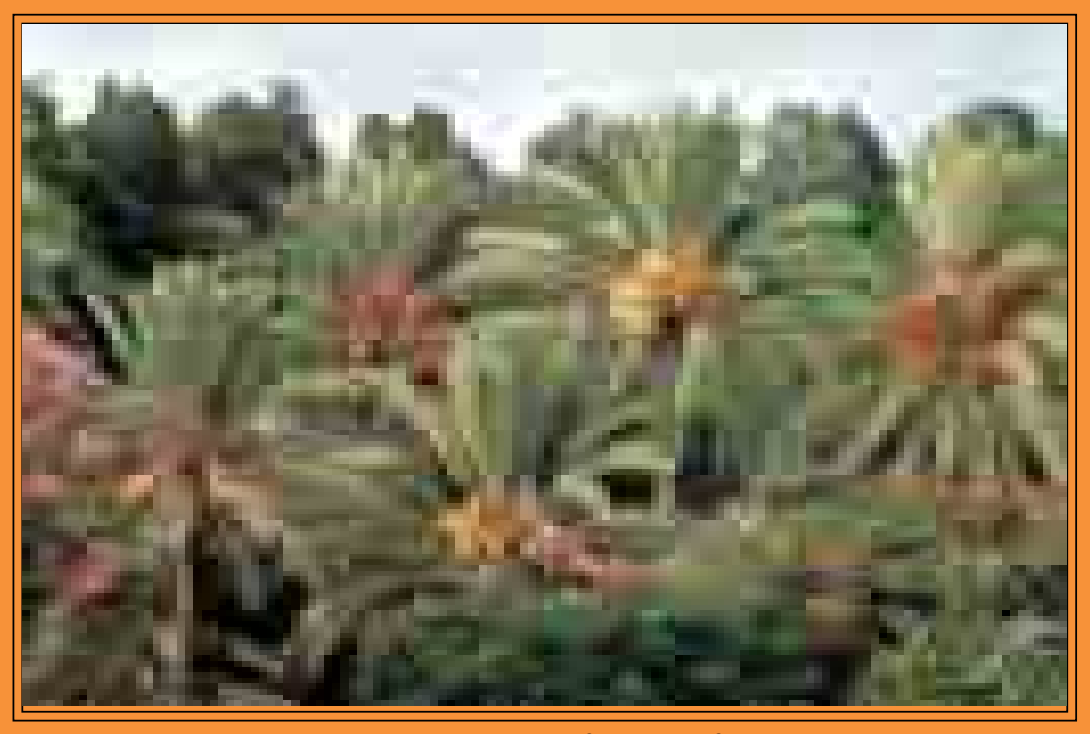
Palm trees on the shore of the Sea of Galilee

Wishing all members a Happy and Kosher Pesach