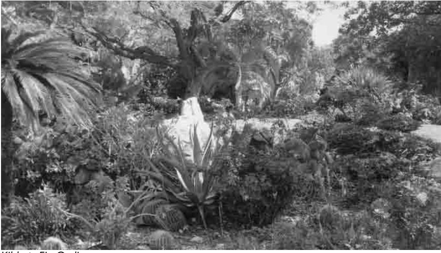
Kibbutz Ein Gedi

are nature reserves with many species of birds, fish and mammals. We saw the mongoose and the night Heron and the St Peter's fish which live in the sweet water pools just before the water runs into the sterile sea. Occasionally when flash floods occur following heavy rain from the hills, some of the fish are carried into the sea and can survive the diluted salinity enough to colonise other pools further along the coast and so cling tenaciously to life in this otherwise hostile environment. Rarely seen here is the leopard which