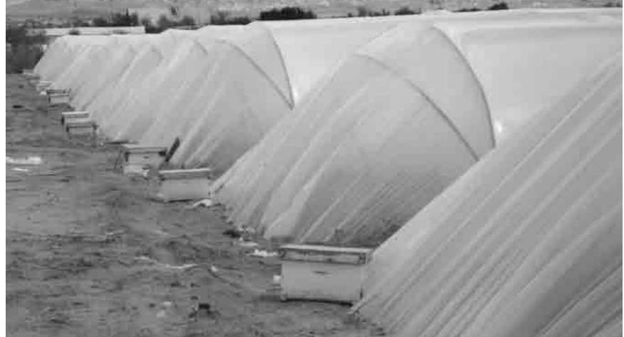
Sodom – cultivation in polythene tunnels

Here are a few hints on water conservation in the garden. Water in the evening when plants have time to take up the moisture and less is lost to evaporation. Make use of water butts to collect rainwater from roofs. Where space permits use two water butts coupled together at the top and bottom to double up on the storage capacity. Hoe between plants in the flower and vegetable beds, this helps in two ways. Firstly, it removes weeds which are always the first to use up the available water and secondly by keeping the surface of the soil open around our plants it enables the rain to penetrate to the roots rather than run off the surface. Incorporate as much compost and