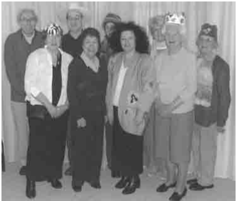
Wessex Vegetarian Group

For the first half of the social, each of us told the group why we had become vegetarian or partly vegetarian (as some people still ate fish). Some of the group were meat eaters but had an interest in vegetarianism.