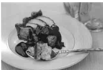
Roasted Almond and Nectarine Pie