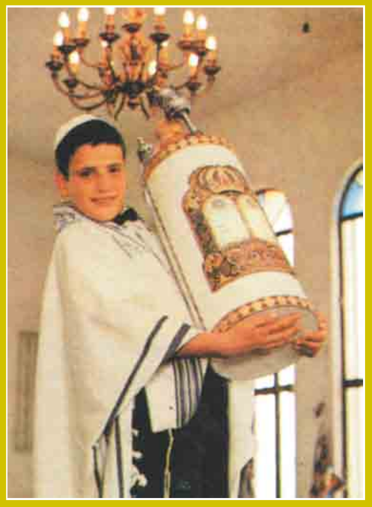
"TIFERET SHLOMO" Boys' Orphan Home